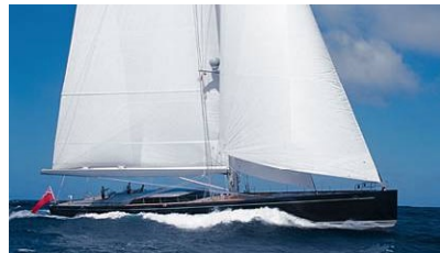
Abeking & Rasmusen 140'